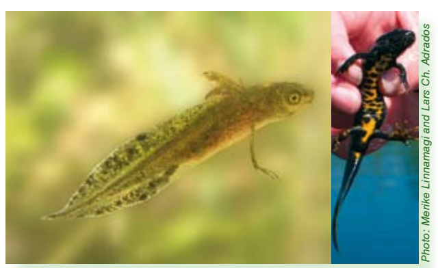
The Great crested newt: larvae and adult

Although the Great crested newt is fairly aquatic, it needs terrestrial habitat for daytime refuge, night time foraging and hibernation. The newt often takes daytime refuge under logs and rocks, where invertebrates gather. Newts forage mostly at night. Foraging appears to take place in such habitats where invertebrate prey is abundant, such as unfertilised grasslands, gardens and deciduous and mixed woodland. The Great crested newt's hibernation sites include, similarly to daytime refuges, underground crevices or cracks, such as voids in tree stumps, rock piles, mammal burrows, dead wood, old walls or cellars.