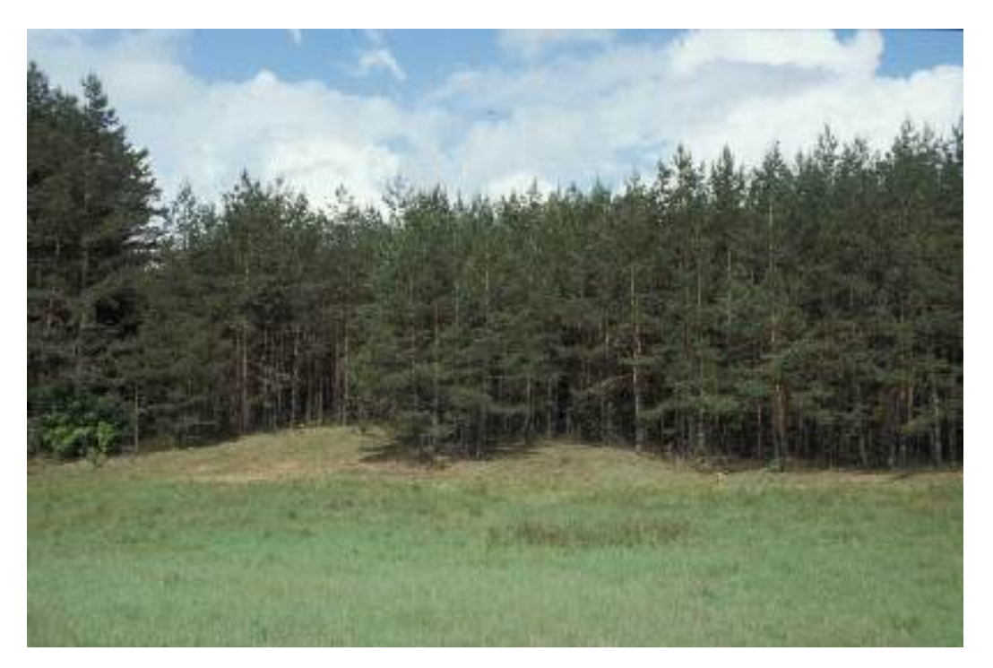
Fig. 6: Main nesting area of Emys orbicularis in Kučiuliškė Herpetological Reserve L05

Since 1997 various investigations of reproduction biology were led in this area. About 70 turtles inhabit the reserve. Female turtles were located by observations, captures and telemetry during nesting period. Three main nesting sites with southern, southeastern or southwestern exposition are known each being separated in 2 or 3 suitable parts (fig. 6).