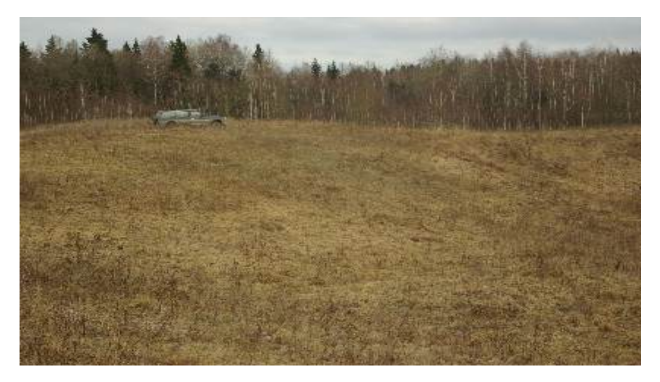
Fig. 3: Another nesting area of Emys orbicularis in Petroškai L03

Another nesting site (with 1 or 2 nests in 2008) on a slope is located near the ponds No. 2 and 3. The place is grazed and mowed regularly every year, so that the habitat conditions are stable here.