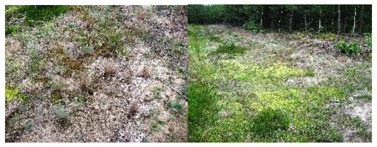
Fig. 19-20: A potential turtle nesting site with female observations in Drawiny/ Uroczysko Puszczy Drawskiej Pk04

Zachodnie Pojezierze Krzywińskie Pk05– 1 place (1 destroyed nest was recognized in the 80's and parts of a turtle carapace were found in the field in 2007), more places are possible, capture of 2 juveniles (1985 and 2009) (fig. 21+22)