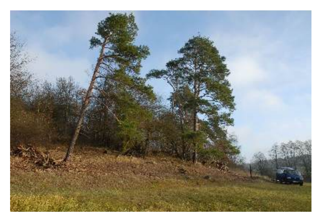
Fig. 23: Main nesting site of Emys orbicularis in Poratz Da03

Tab. 6: Usage of the nesting sites by Emys orbicularis females and the conditions for reproduction success in Poratz Da03