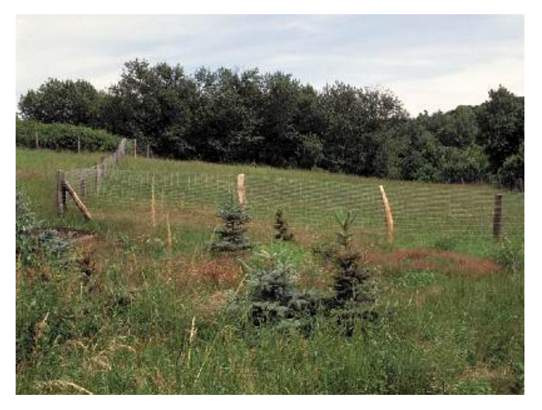
Fig. 29: Fenced nesting site of Emys orbicularis in Brodowin - Parstein Da05

The project investigations on the occurrence of Emys orbicularis in Brodowin-Parstein Da05 showed that the species has already become extinct. Nevertheless, the existence of some single individuals can be assumed in Breitefenn, where the last nesting female was observed in the end of the 1990s (SCHNEEWEISS 2003). This area absolutely appears suitable for the resettlement of Emys orbicularis - under certain conditions. Concerning its climatic (the most eastern/ sunniest nesting site) and microclimatic (windbreak, south-exposed hillside situation) qualities this nesting site is the most favourable in the whole Brandenburg project area (fig. 28). The present conditions of the nesting site are evaluated as excellent (A) (tab. 10).