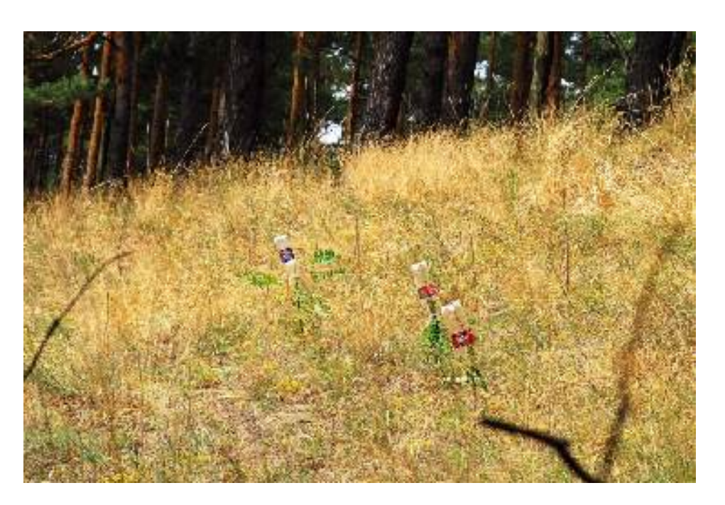
Fig. 18: A nesting area of Emys orbicularis with protection against predators in Ujście Ilanki Pk03

All nests were localized on sunny slope overgrown mainly by whitish hair-grass ( Corynephorus canescens ). Among other plants in that site were such species like: stonecrop ( Sedum acre ), common bent ( Agrostis capillaries ), corn spurry ( Spergula arvensis ), common evening primrose ( Oenothera biennis ), mouse-ear hawkweed ( Hieracium pilosella ), perennial knawel ( Scleranthus perennis ), sheep's fescue ( Festuca ovina ), wild thyme ( Thymus serpyllum ) and dark mullein ( Verbascum nigrum ) (NAJBAR unpubl.).