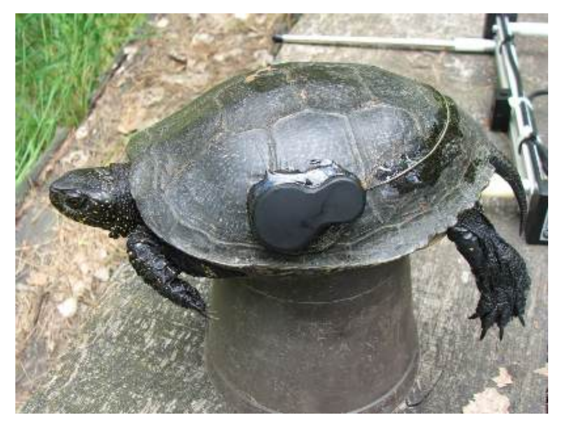
Fig. 13: A female of Emys orbicularis with transmitter in Jeziora Pszczewskie i Dolina Obry Pk01

In East-Poland some single observations of female turtles during nesting period were led to locate nests and nesting sites. Due to the lack of turtle observations in Bialowieza – no turtle could be found between 2007 and 2009 –, no current data on reproduction and nesting could be gathered. Only, one female turtle was captured in June 2006