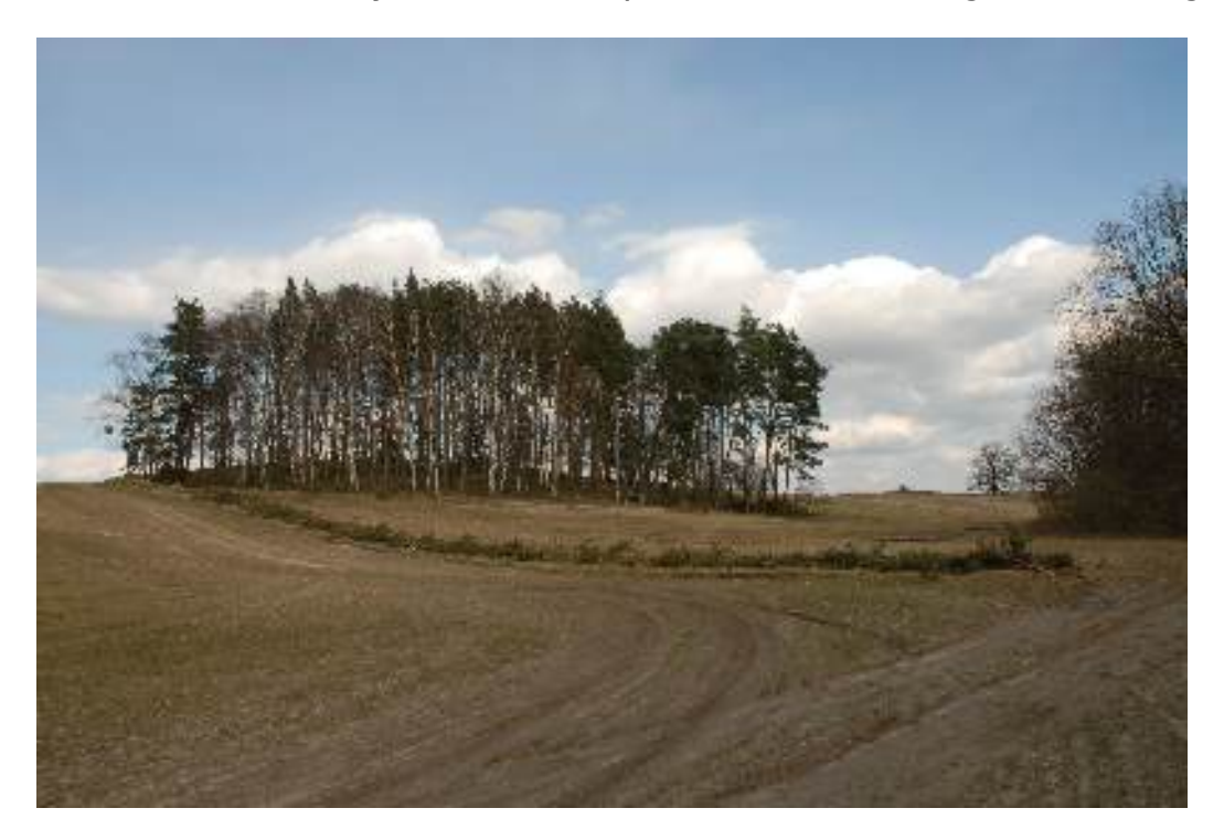
Fig. 27: Hedge plantation near one nesting site of Emys orbicularis in Kölpinsee Da04

In the area of the nesting sites a consistent hunting of potential predators (wild boar, fox, raccoon dog, racoon ...) took place during the whole project, because there is a support by the responsible local hunter's union. Known nests were weathered and covered with wire nettings immediately after the egg-laying. In contrast to former years no nest predation was recognized during the project.