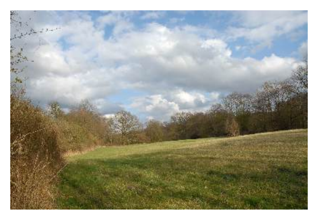
Fig. 24: Meadow as nesting site of Emys orbicularis in Poratz Da03