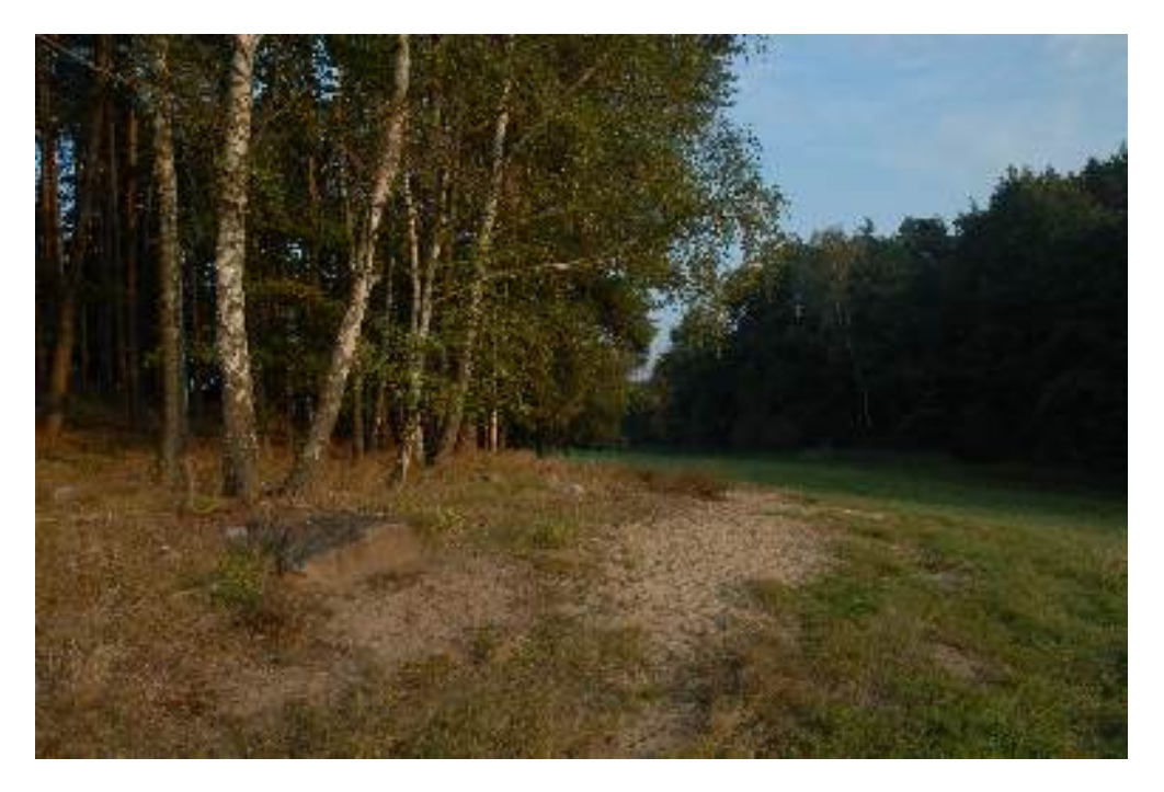
Fig. 26: Nesting site of Emys orbicularis in Kölpinsee Da04

Female observations and telemetry during nesting period showed that the nesting sites "Hangwiese" and "Waldrand" are significant, traditional nesting sites of the population. Both nesting sites offer favourable breeding conditions for a bigger number of clutches. However, the number of adult females is dropped on a minimum (n: 1-2) nowadays as a result of a high predation pressure by racoons.