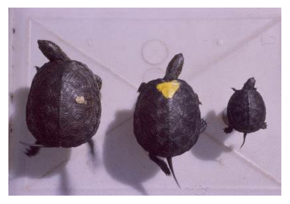
Fig. 7: Juveniles of Emys orbicularis from 2 different successful hatching years in Kučiuliškė Herpetological Reserve L05

Approximately 70 % of all reproductive females reproduce per year. The Kučiuliškė-population is subdivided into two main pond complexes (A, G). Females of pond-complex A prefer other nesting sites than females of pond G. The nesting sites of A-females are more located around pond A and its summer ponds and the nesting sites of G-females lie more close to pond G and its summer ponds.