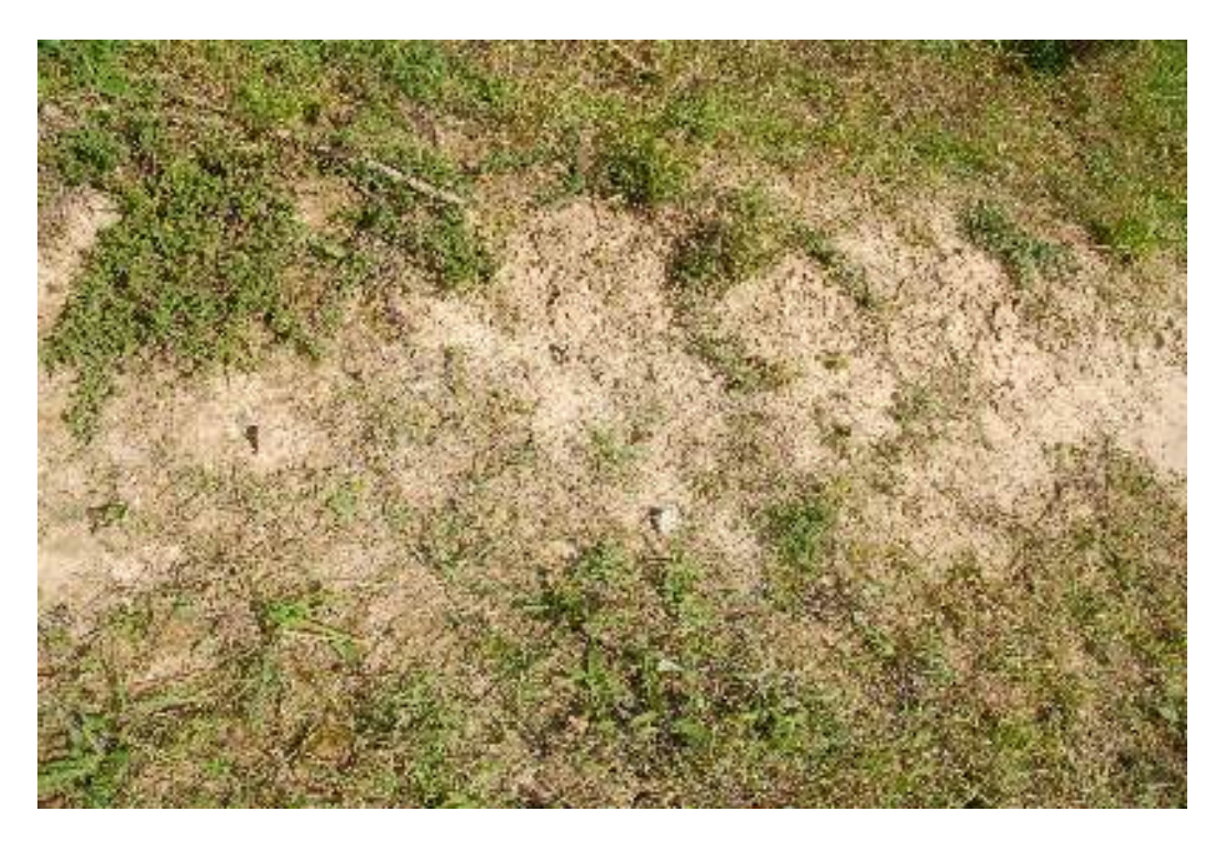
Fig. 25: Nest of Emys orbicularis protected by means of wire netting in the main nesting site in Poratz Da03