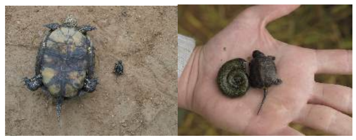
Fig. 21-22: A new juvenile turtle in Drzeczkowo 1/ Zachodnie Pojezierze Krzywińskie Pk05 (May 2009)