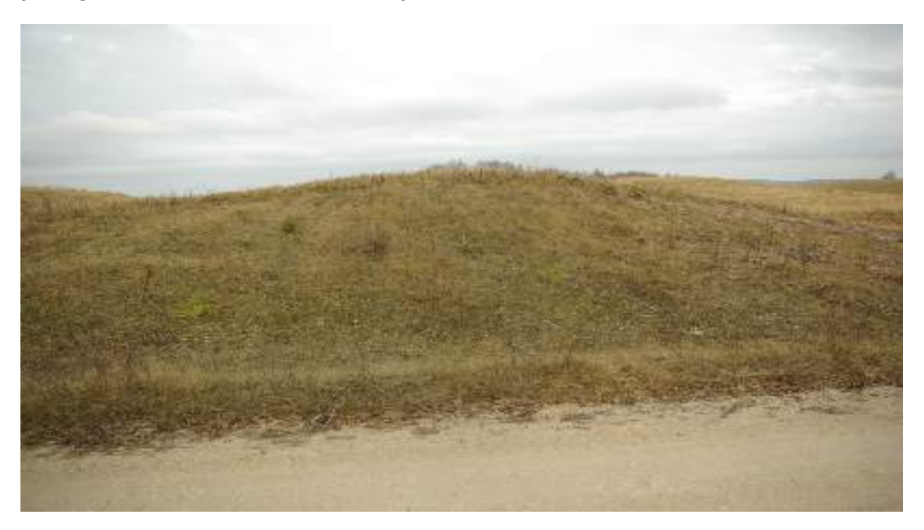
Fig. 2: Nesting area of Emys orbicularis close to the road in Petroškai L03

Currently, 5 nesting sites are known in Petroškai. Female turtles of the same hibernation pond search for different nesting sites. Females hibernating in the main hibernation pond in the alder forest use open areas nearby the ponds 3, 4, 5, 7, 8, 9 and 10 in the north. Two of the known nesting sites are situated near pond No. 1, where females lay eggs in the edge of the road or in the slope of drained ditches. Since 2003 nesting sites have been covering by wire net as protection against nest predators. A big threat for females and hatchlings is the traffic in this place. The microclimatic conditions are suitable in this area and young turtles hatched successfully.