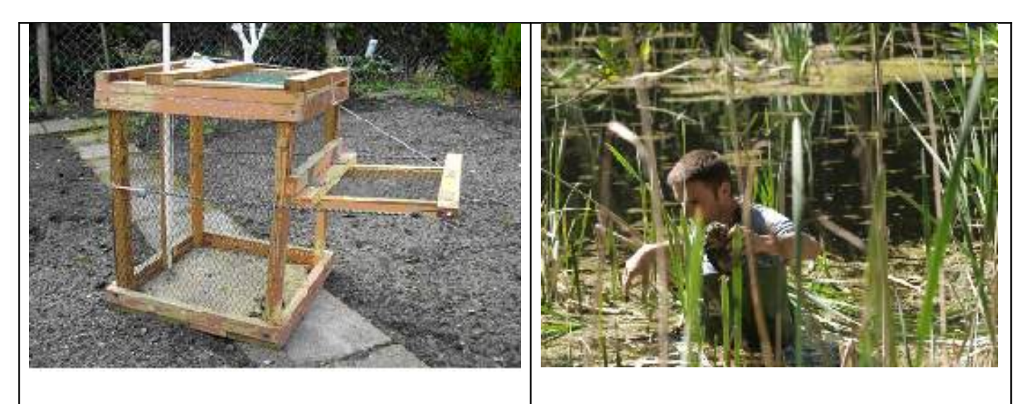
Fig. 11-12: Methods of captures of Emys orbicularis in Western Poland [baited trap (fig. 11), capture by hand (fig. 12)]