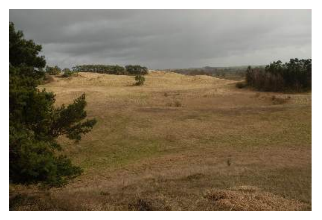
Fig. 28: Historical nesting site of Emys orbicularis in Frauenhagen Da01

During the project it could be confirmed that the historically known occurrence of Emys orbicularis is disappeared in this area. The last adult female was proved in 1994 (SCHNEEWEISS 2003).