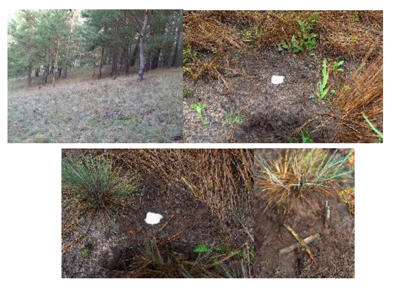
Fig. 14-17: Nesting site of Emys orbicularis in Ujście Ilanki Pk03 - general view (fig. 14) and three separate nests marked by rock or wooden sticks in 2009 (fig. 15-17)

In 2008 one nesting area of Emys orbicularis was found in Ujście Ilanki site (fig. 12-18). It was located on small forest clearing, close to a channel, which is one of the most important summer sites for turtles. With the help of radiotracking of 4 females 6 nests were localized in 2008 and 7 nests in 2009.